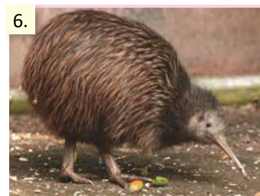
Smallest flightless bird