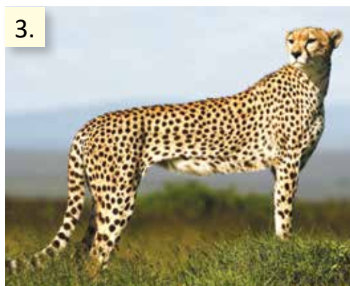
Fastest land animal